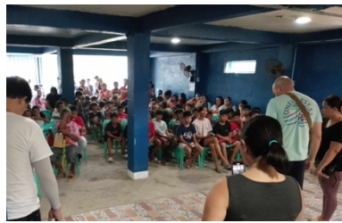
A Captive Audience to Hear Good News b4 seeing the Doctors