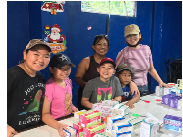
Kids on Mission!